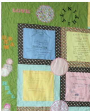
Preserving memories one stitch at a time.