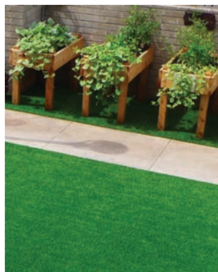
Providing our guests with fresh, organic vegetables from our garden.