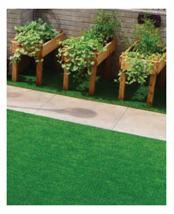
Providing our guests with fresh, organic vegetables from our garden.