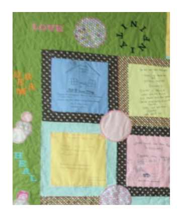
Preserving memories one stitch at a time.