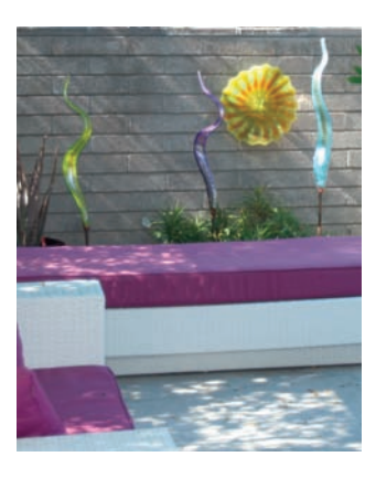
Adorning our patio with glass art sculptures.